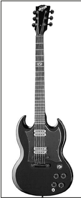
2006 Gibson SG Menace