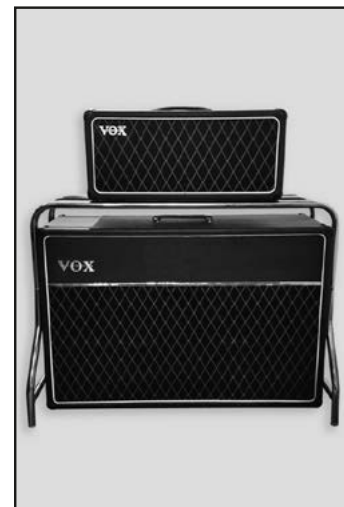
1966 Vox AC50 Head and 2X12" Cabinet