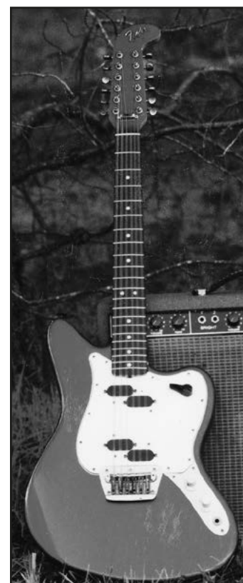
1965 Fender Electric XII