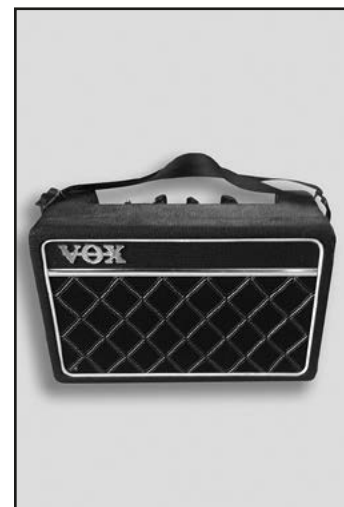
1970 Vox Escort