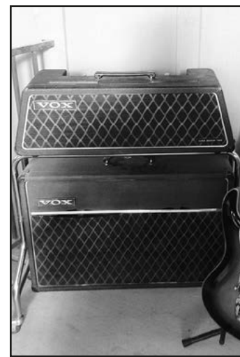
1965 Vox Berkeley II