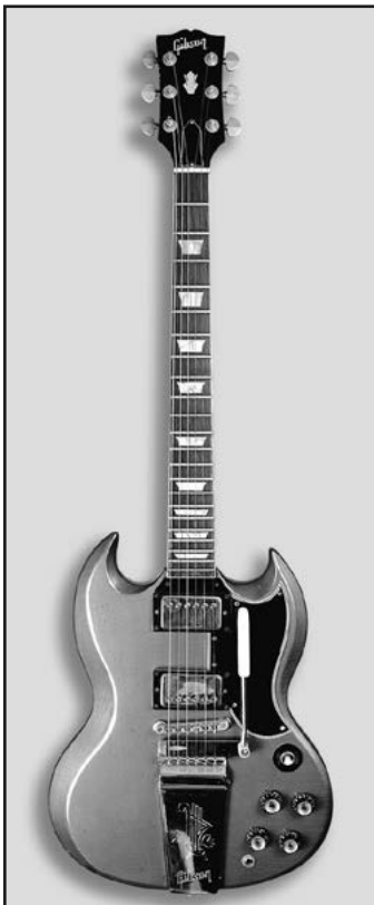
1965 Gibson SG Standard