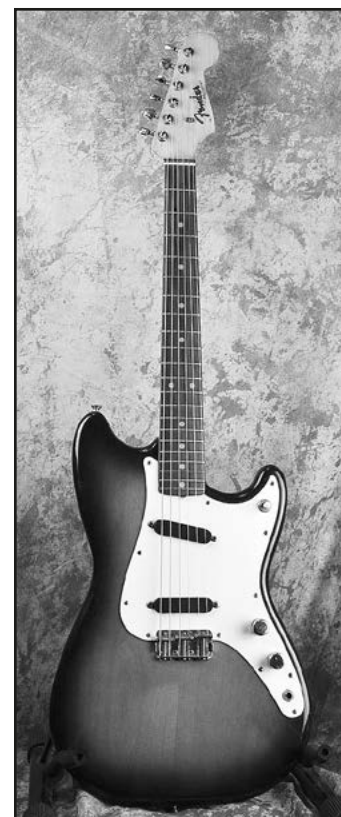
1964 Fender Duo-Sonic